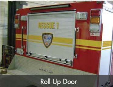
Roll Up Door