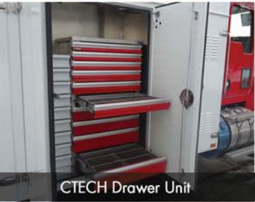
CTECH Drawer Unit