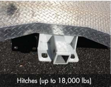
Hitches (up to 18,000 lbs)