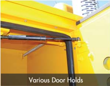
Various Door Holds