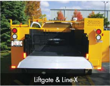
Liftgate & Line-X