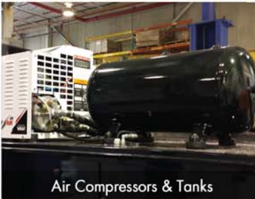
Air Compressors & Tanks