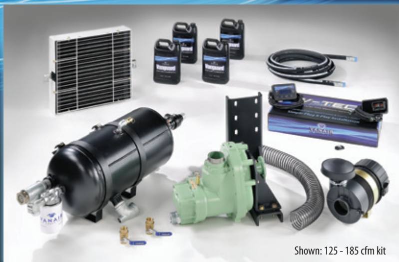
Shown: 125 - 185 cfm kit