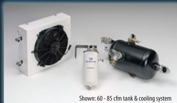
Shown: 60 - 85 cfm tank & cooling system