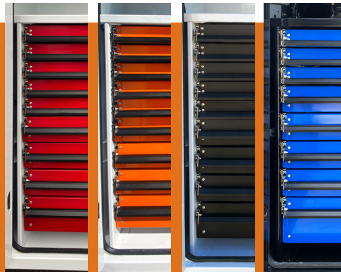
CUSTOM TOOL CHESTS

WE DON'T JUST BUILD TRUCKS We keep them moving